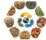
AGRO WASTE TO ENERGY