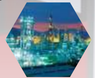
ENERGY RECOVERY FROM TAR SAND & OIL