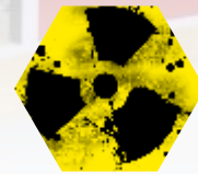
RADIO ACTIVE WASTE