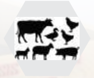
ANIMAL CARCASS DISPOSAL