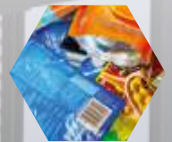
RECOVERY FROM FMCG WASTE