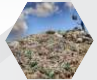
SAFE DISPOSAL OF MSW

Specifications subject to change without prior notice due to continuous technical development.