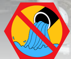
CHEMICAL EFFLUENTS TREATMENT