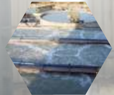
WASTE WATER DISPOSAL