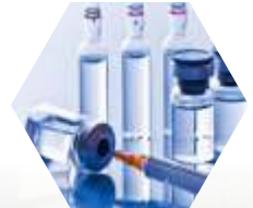
PHARMACEUTICAL WASTE DISPOSAL